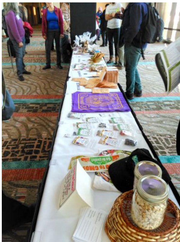
Seed swap table: ACORN Conference & Trade Show, Charlottetown, PEI.

In November 2015 Charlottetown, PEI hosted a conference led by ACORN, and one entire day was devoted to the methods of saving seed which was attended by hundreds of individuals. During the conference, a teacher-student type of classroom was created where all of the farmers, all of the representatives from various organizations, were then taught by the speaker to enhance their skills and knowledge surrounding seed saving. This is an example of how an interested group of individuals can work together to share information that benefits the environment, as well as being cost-effective.