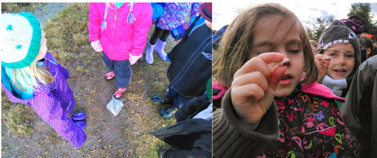
Right: Children marvel at the seeds they acquire after they winnow the beans. Left: Children participate in separating the seed from chaff.