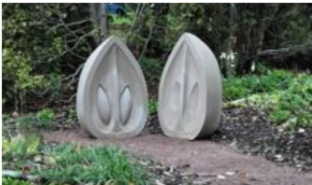
Sculpture at Dalhousie University Agricultural Campus.

This partnership begun in 2014 between the Dalhousie University Agricultural Campus, SODC, and ACORN. The seeds that make up the bank will be grown by farmers in the Atlantic Canadian region. A portion of the seed will be stored for the long term, a portion for short term, and a portion will be stored as redundant seed in the national bank in Waterloo, Ontario at SODC headquarters where all varieties within similar projects are kept. Keeping seeds in multiple locations increases the security of the variety. The intention of the seed bank is to retain varieties of seed that are culturally, historically, and agronomically important for the Atlantic Canadian region. As of December 2015 there were 29 varieties of vegetable and grain that have been added into the seed bank, with plans of more to be added each year.