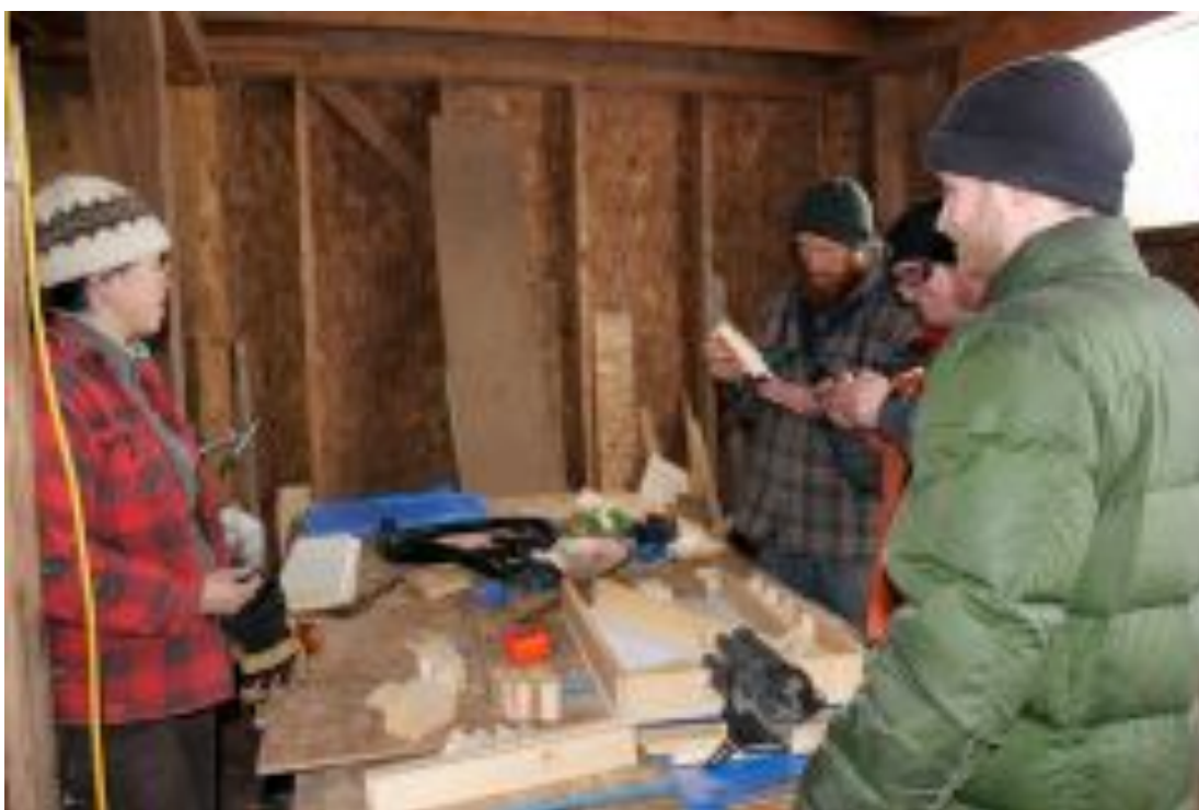
Members from the CESGC working together to build a column blower, used to clean large quantities of seed.