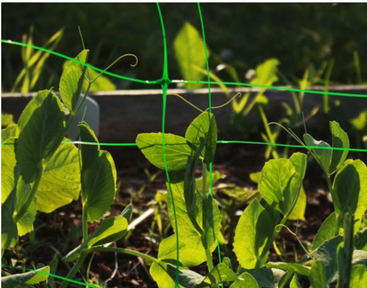
Peas being grown in the Sackville Community Garden to be harvested for seed. (Source: Norma Jean Worden-Rogers).