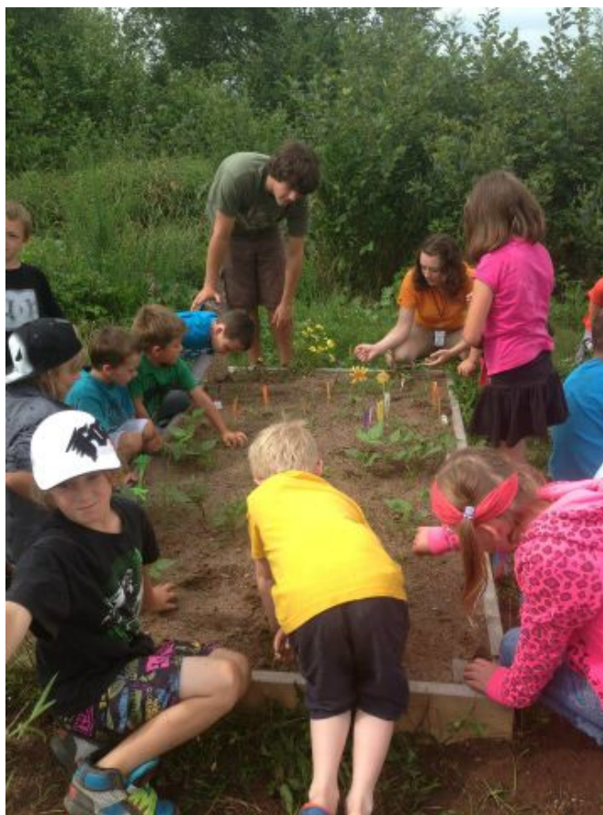
Children are taught how to plant, led by JFI Employees as part of their summer camp program.

The adaptation of a task, like seed saving, into a teachable skill to children bridges the growing divide between people and plate. As Jamie Oliver famously observed in American schools when filming his 2010-11 television show American Food Revolution , some children can no longer identify vegetables, or know where their food is coming from. Through teaching the lifecycle of a seed, children can then make connections to the wider environment, and more importantly strengthen the connections and knowledge surrounding food. When such connections are made, the information is then passed along to parents, siblings, and teachers. The provided examples of seed saving are to show that it is not limited to adults, and is an integral concept that fits into any biology class, as seen at Salem Elementary School, or a summer camp, as seen at JFI.